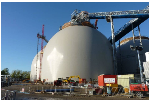
Drax’s wood pellet silos.

Drax’s application for capturing carbon at its biomass facility does not concern itself with transport and storage aspects, a worry in itself as Drax has lobbied for continued subsidies for biomass burning which are decoupled from subsidies for capturing carbon . Based on its recent consultation , the UK government looks keen to oblige, given it was inviting applications for such subsidies as part of the consultation rather than awaiting the outcome. It would seem that Drax’s BECCS plans are more about capturing subsidies than carbon—think tank Ember predicts Drax’s BECCS plans will require £31.7 billion in subsidies .