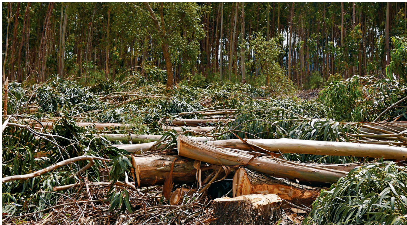
Biodiversity-destroying eucalyptus plantations would undoubtedly provide much of the raw material for BECCS

Additionally, shipping 5.67 million tons of pellets by container vessel across the Atlantic annually generates pollutants and greenhouse gas emissions, among them around 600 million tons of CO 2 . 9